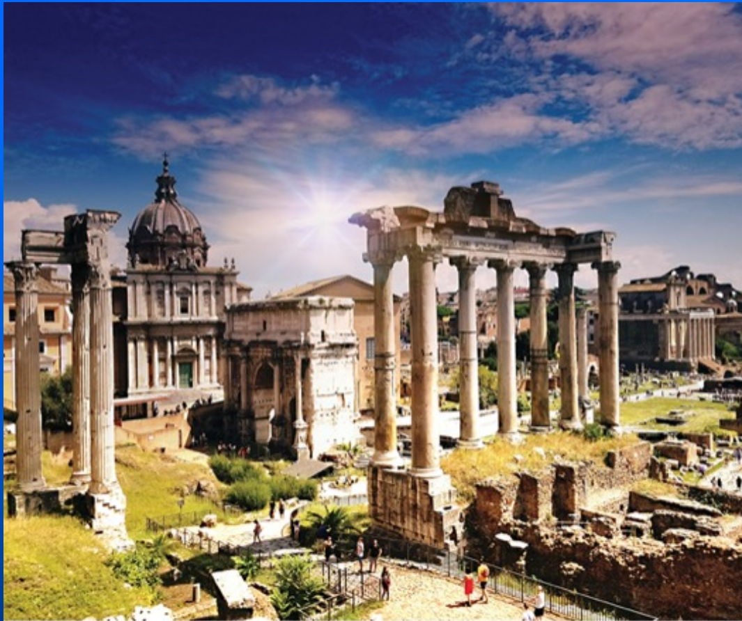
Figure 12.1. The forum in Rome

Jan. 14 th and 21 st 2024 Our Spring Semester