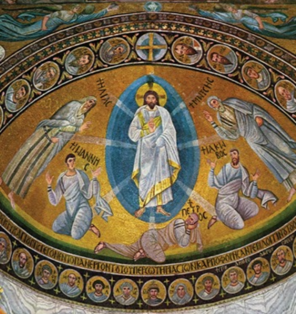
Transfiguration Mosaic (565-66) from St. Catherine's Monastery, Mount Sinai (Egypt). Page 142. Reference 6